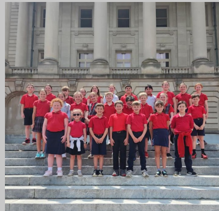
4th Grade on the steps of the Capitol in Frankfort