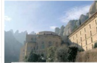
Sanctuary of the Madonna of Montserrat