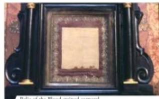
Relic of the Blood-stained corporal