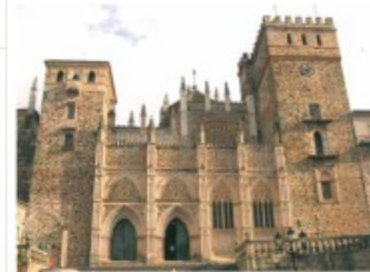
Church of Nuestra Señora of Guadalupe

Even today, in the sanctuary of Guadalupe, it is possible to admire the precious relics of the Corporal and of the bloodied pall (the pall is the small rigid linen cloth, of square shape, that serves to cover the chalice and the paten), used during the miraculous Mass from the Venerable Don Pedro Cabañuelas, in the region of Toledo. He was always distinguished for his deep devotion to the Holy Eucharist, and he spent many hours in adoration both night and day before the Blessed Sacrament. He had been brutally tempted to doubt about the reality of transubstantiation, but in 1420 all of his doubts had disappeared. As he had been accustomed to do daily, Don Pedro began to celebrate the Holy Mass: at the moment of the consecration he saw a dense cloud to come down from above and settle itself above the altar. He could not see anymore.