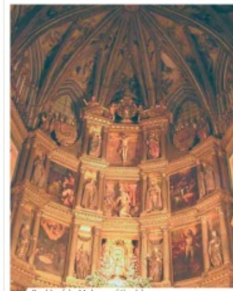
Retable of the Madlena of Guadalupe