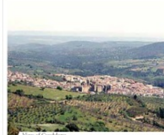
View of Guadalupe