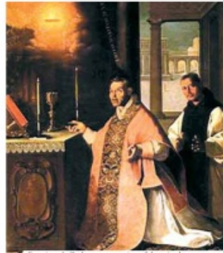
Francisco de Zurbarán, re-creation of the miracle

During the celebration of the Mass, a priest saw numerous drops of Blood fall from the consecrated Host. The miracle contributed to strengthening the belief of the priest and many of the faithful, among whom was also the King of Castile. There are numerous documents that testify to the miracle. The relics of the marvel had been exhibited to the veneration of the faithful during the Eucharistic Congress of Toledo in 1926 and even today are the objects of deep devotion to the whole of the Spanish people.