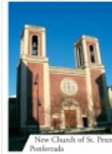
New Church of St. Peter, Ponferrada