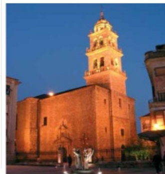
Church of St. Mary where the miracle took place, Ponferrada