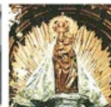
The Virgin of the Evergreen Oak