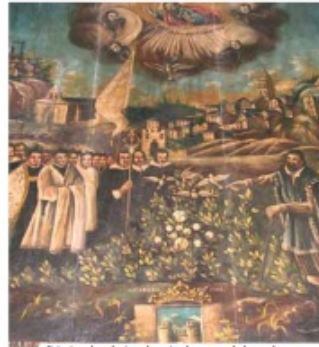
Painting that depicts the miracle, currently housed in the new church of St. Peter