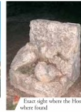
Exact spot where the Hosts were found