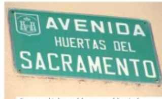
Street named in honor of the recovery of the miracle