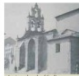
Ancient church of St. Peter, demolished in the 20 th century, where the painting of the miracle was previously housed, Ponferrada