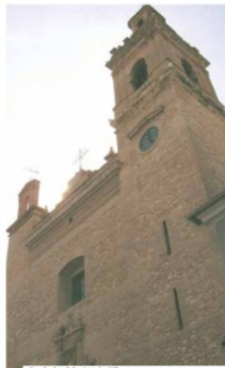
Our Lady of the Angels, Silla