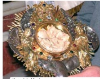
Hosts of the Miracle

The Eucharistic miracle of Silla happened in 1907. Some Hosts, stolen by unknown thieves, were recovered in perfect condition, hidden under a stone in a little garden not far from the city. Even today it is possible to adore the miraculous Hosts: they remain intact since almost one hundred years ago. The Hosts are preserved in the church of Our Lady of the Angels, in Silla. Still today it is possible to adore the uncorrupted Host preserved in the church of this town at the outskirts of Valencia.