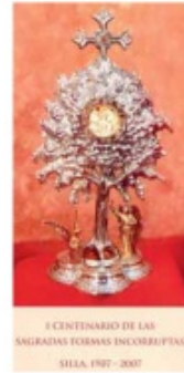
CENTENARIO DE LAS SAGRADAS FORMAS INCORRUPTAS SILLA, 1907 - 2007