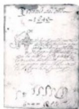
Original document restored by Miguel Andrea on April 2, 1640 certifying the miracle of Calanda