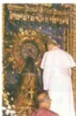
John Paul II praying in front of the statue of the Virgin of Pilar, Zaragoza