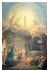
Ancient painting depicting the miracle in the Sanctuary of Pilar