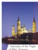
Sanctuary of the Virgin of Pilar, Zaragoza