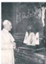
Pope Pius XII praying before the statue of the Virgin of Pilar that he received as a gift