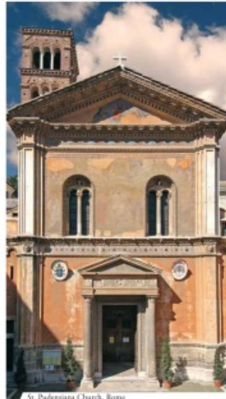
St. Pudenziana Church, Rome

It is still possible today to see the miraculous imprint left by the Host which fell on the steps of the altar in the Caetani Chapel of Santa Pudenziana Church in Rome. The imprint on the step was left when the Host fell from the hands of a priest, who, while celebrating Mass was taken with doubt on the Real Presence of Christ in the sacrament of the Eucharist.