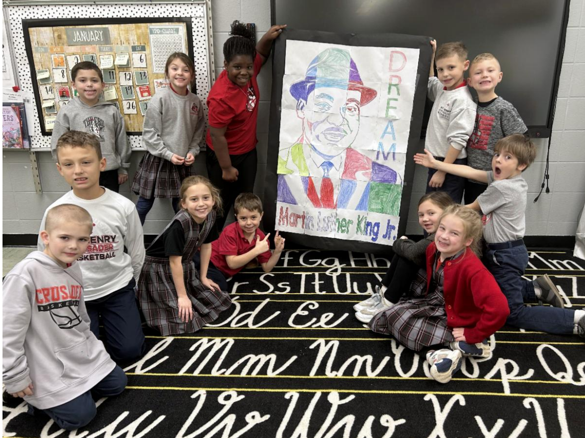
Our second grade students celebrated the inspirational life of Dr. Martin Luther King Jr. by reading books about his life and creating this collaborative mural!