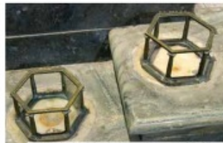
Steps in the chapel that clearly show the imprint of the fallen Host and the stain of Blood left by the same