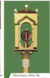
Monstrance where the reliquary of the miracle is kept