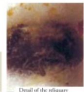
Detail of the reliquary