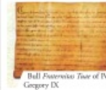
Bull Fraternalis Tuas of Pope Gregory IX