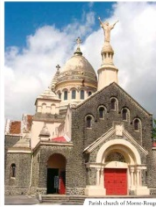
Parish church of Morne-Rouge

The prodigious event was accompanied by an apparition of Jesus and His Sacred Heart in the Host exposed for public Eucharistic adoration. There were many witnesses to that extraordinary phenomenon.