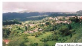
View of Morne-Rouge