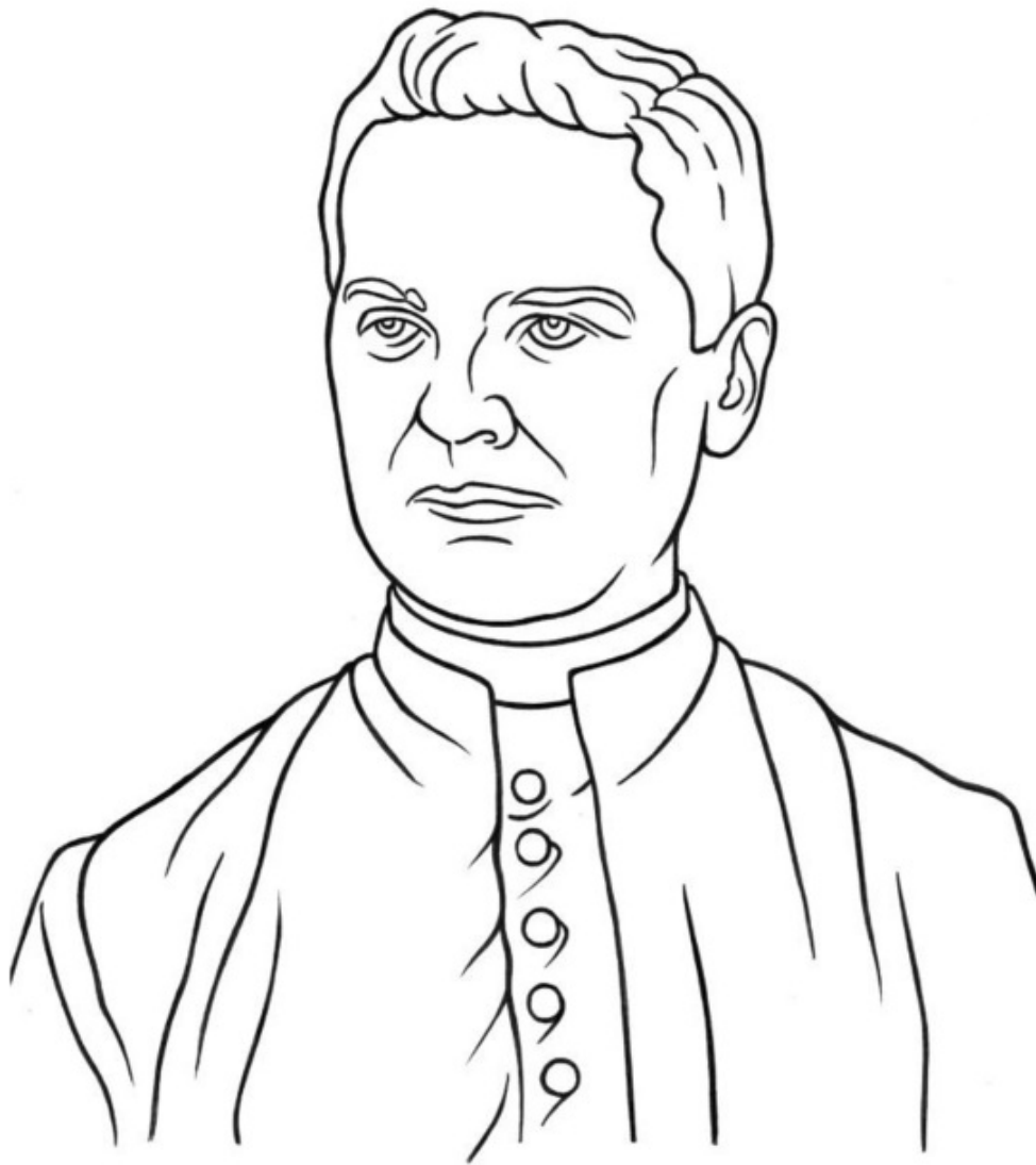
Blessed-Michael-McGivney

Our History & Heritage: Founded on the principles of charity, unity, and fraternity, the Knights of Columbus were established in 1882 by Fr. Michael J. McGivney, assistant pastor of St. Mary's Church in New Haven, Connecticut, and a group of parishioners. Their intent? To bring financial aid and assistance to the sick, disabled, and needy members and their families. Today, Fr. McGivney is being considered for sainthood. Color and bring this page to the Fr. Bealer Knights of Columbus fish fry on Friday, December 1, and you could win a prize! Must be present to win.