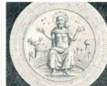
Dijon, Host sent in 1455 by Pope Eugene IV to Philip the Handsome, Duke of Borgogna.

The miraculous Host was burned. Many are the documents and the works of art which illustrate the miracle. For example, one of the stained glass windows of the Cathedral of Dijon in which the main scene of the marvel is portrayed.