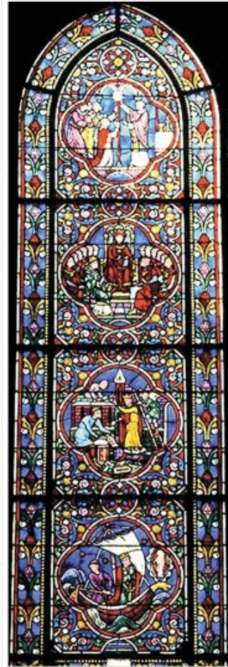
Stained glass window of the Holy Chapel in the Cathedral of Dijon. In the first frame a priest presents the miraculous Host which was kept until the French revolution.

In 1430, in Monaco, a lady purchased a monstrance from a second hand dealer. It was most likely stolen because it still contained the Sacred Host for adoration. The lady, being very ignorant in regard to the Real Presence of Christ in the Eucharist, decided to remove the Host from the monstrance, with a knife. Unexpectedly the Host began to drip living Blood which dried immediately, leaving imprinted the image of the Lord, seated on a semicircular throne with some of the instruments of the Passion on the side.