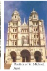
Basilica of St. Michael, Dijon.