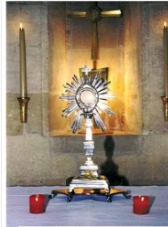
Monstrance of the miracle