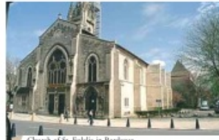
Church of St. Eulalia in Bordeaux

In the Eucharistic Miracle of Bordeaux, Jesus appeared giving a blessing for more than 20 minutes in the Host exposed for public adoration. Even today it is possible to visit the Chapel of the Miracle and venerate the precious Relic of the Monstrance of the apparition, which is kept in Martillac, France, in the church of the contemplative community "La Solitude".