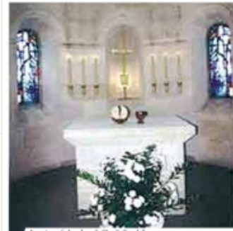
Interior of the church 'La Solitude'

The Eucharistic Miracle of Bordeaux is closely connected to the Community founded in 1820 by the Venerable Father Pierre Noaille, the Community is still active today, especially in Asia and Africa. The marvel occurred twenty months after the foundation of the Community, in their Church of St. Eulalia in Rue Mazarin, Bordeaux. Jesus appeared in the Host immediately after Abbot Delort – who was precisely that day substituting for Fr. Noaille in the liturgical celebrations – gave the benediction with the Blessed Sacrament.