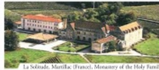
La Solitude, Martillac (France), Monastery of the Holy Family