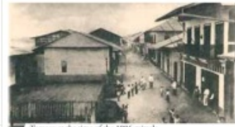
Tumaco at the time of the 1906 miracle