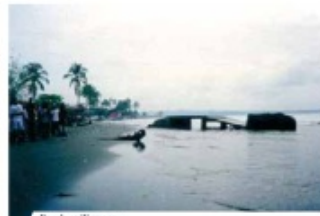
Beach at Tumaco