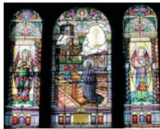
Stained glass window depicting the vision of Saint Juliana