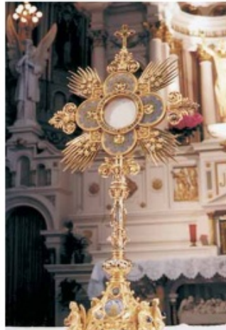
Monstrance that is kept in the Sanctuary of Saint Juliana, Liège

“Even though the Eucharist is solemnly celebrated every day of the year, on one day we pay special honor to the Body of Christ. We may, of course, invoke the Lord with our minds and our spirits at any time, but we do not in this way obtain the Real Presence of Christ. With the Eucharistic commemoration, however, Jesus Christ is actually present with us in his own substance. As the risen Christ told us prior to his Ascension: ‘And behold, I am with you always, until the end of the age.’ (Mt.28, 20) ...He would remain and be with them even by His bodily presence.” Pope Urban IV: TRANSITURUS DE HOC MUNDO