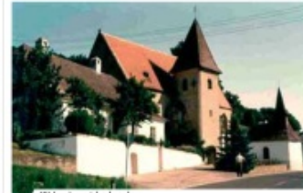
Weiten's parish church