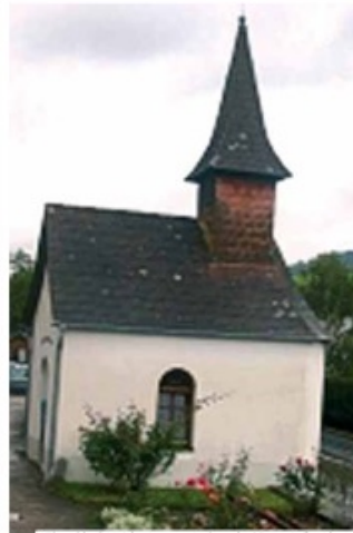
Chapel built on the exact spot where the Host was found