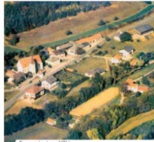
Panoramic view of Weiten

In fifteenth-century Austria there were a number of thefts of consecrated Hosts, so Church authorities took to keeping the Hosts in the sacristy. Despite these precautions, a thief succeeded in 1411 in stealing a consecrated Host from the parish church in Weiten. The Host slipped unnoticed to the ground during his journey and was discovered several days later by a pious woman. The Host glowed brilliantly, divided in two pieces but united by threads of bleeding flesh.