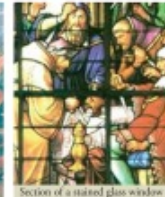
Section of a stained glass window in the Cathedral of St. Gudula and St. Michael, in which the Eucharistic miracle is depicted