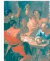
The Eucharistic Miracle at Brussels, Heron Museum, Paris-le-Monial