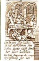
Old print that portrays the Miracle