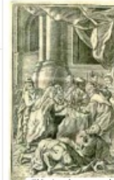
Old print that portrays the Miracle