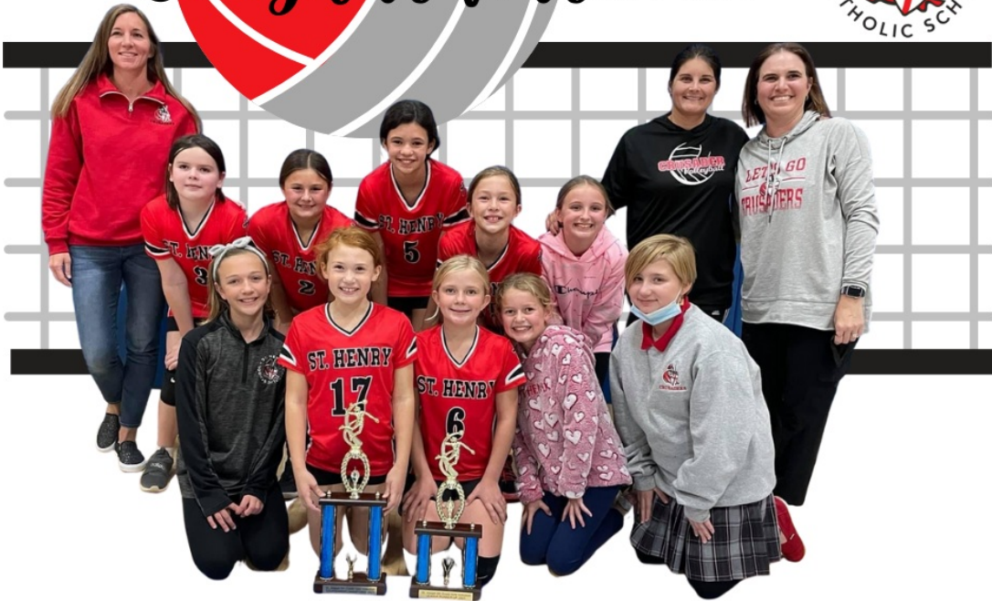
Tournament Champions Second Place in League Play